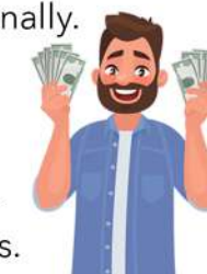
PHOTO CONTEST & CALENDAR

Funds that are not claimed are used for our scholarship program and other charitable purposes.