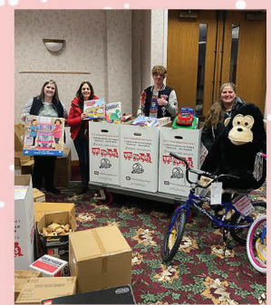
GREEN LAKE CO.