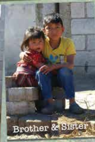
Brother & Sister