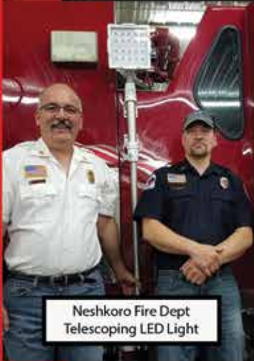
Neshkoro Fire Dept Telescoping LED Light

The second week of October is Fire Prevention Week. Adams-Columbia's Operation Round-Up program has given to numerous fire departments in our service territory. In the last five years alone, Operation Round-Up has donated nearly $50,000 to 16 fire departments. This funding has been used for things like new LED lights, thermal cameras, fire truck repair, and protective fire gear.