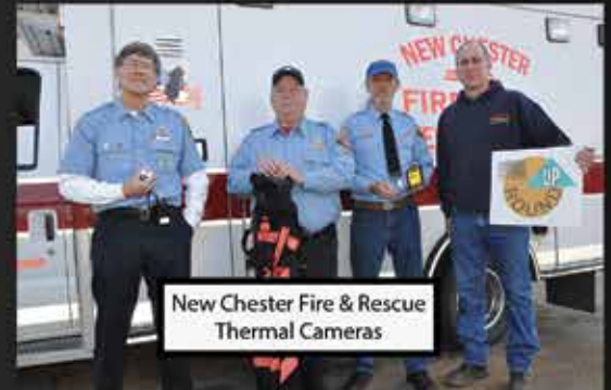
New Chester Fire & Rescue Thermal Cameras