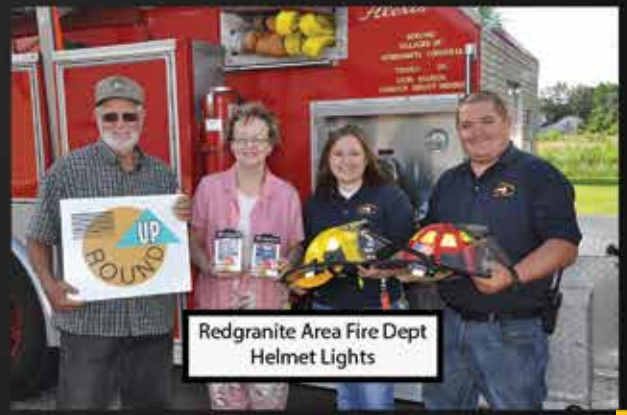
Redgranite Area Fire Dept Helmet Lights