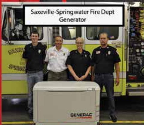
Saxeville-Springwater Fire Dept Generator