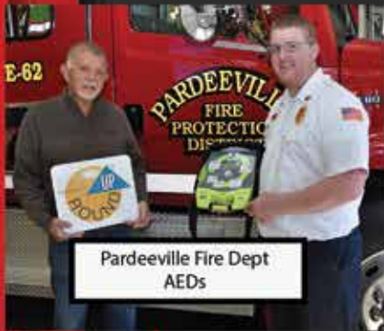
Pardeeville Fire Dept AEDs

All of these funds go into a special account that is used for charities, individuals, and families in our communities. Funds cannot be used for political purposes or to reimburse the cooperative for any expenses or unpaid energy usage. Operation Round-Up even has its own board that's separate from our board of directors, that oversees the program. It's comprised of one board member from each of Adams-Columbia's districts, and up to four at-large members. The board is responsible for reviewing applications and awarding funds. Applications can be found on our website. Both organizations and individuals can apply for Operation Round-Up funds. Upcoming application deadlines are October 15 and January 15.