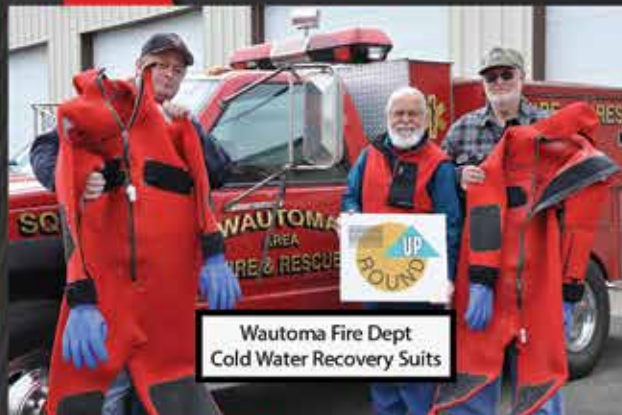
Wautoma Fire Dept Cold Water Recovery Suits