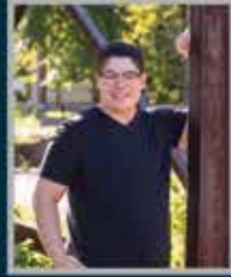
Sky Sharp Wautoma/2019