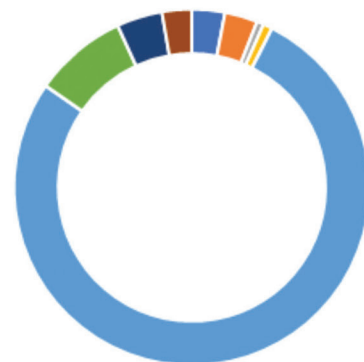
Outage Hours by Cause